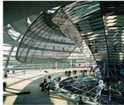
Garden of Eden Architect: Nicholas Grim Shaw Using solar collector and heat Bank