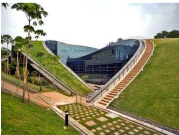
School of Nursing and Health Sciences Center, University of Texas, Houston architects NIMB