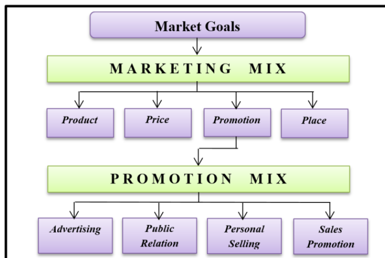
Figure 1: theoretical framework of the study (Kotler and Armstrong, Marketing principles, Translated by Bahman Fooroozandeh, 2014)