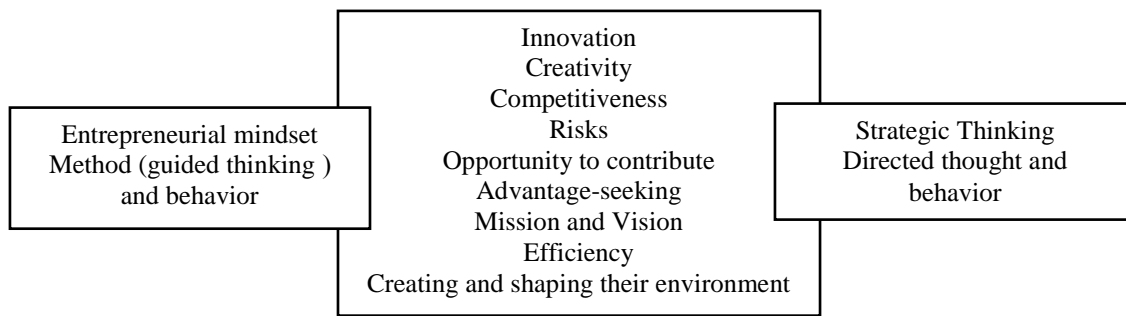
Figure 1, Model of strategic Entrepreneurial mindset